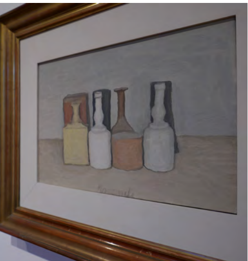
Via Leoni, Verona