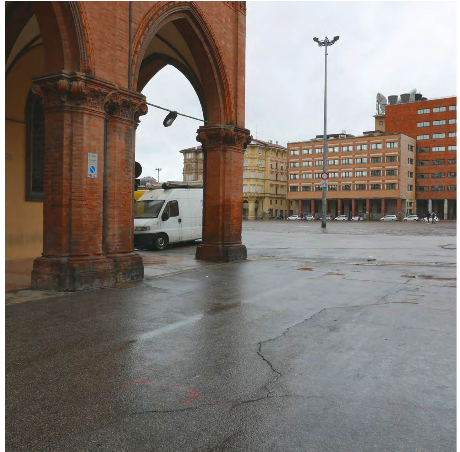
Piazza del Otto, Agosto, Bologna