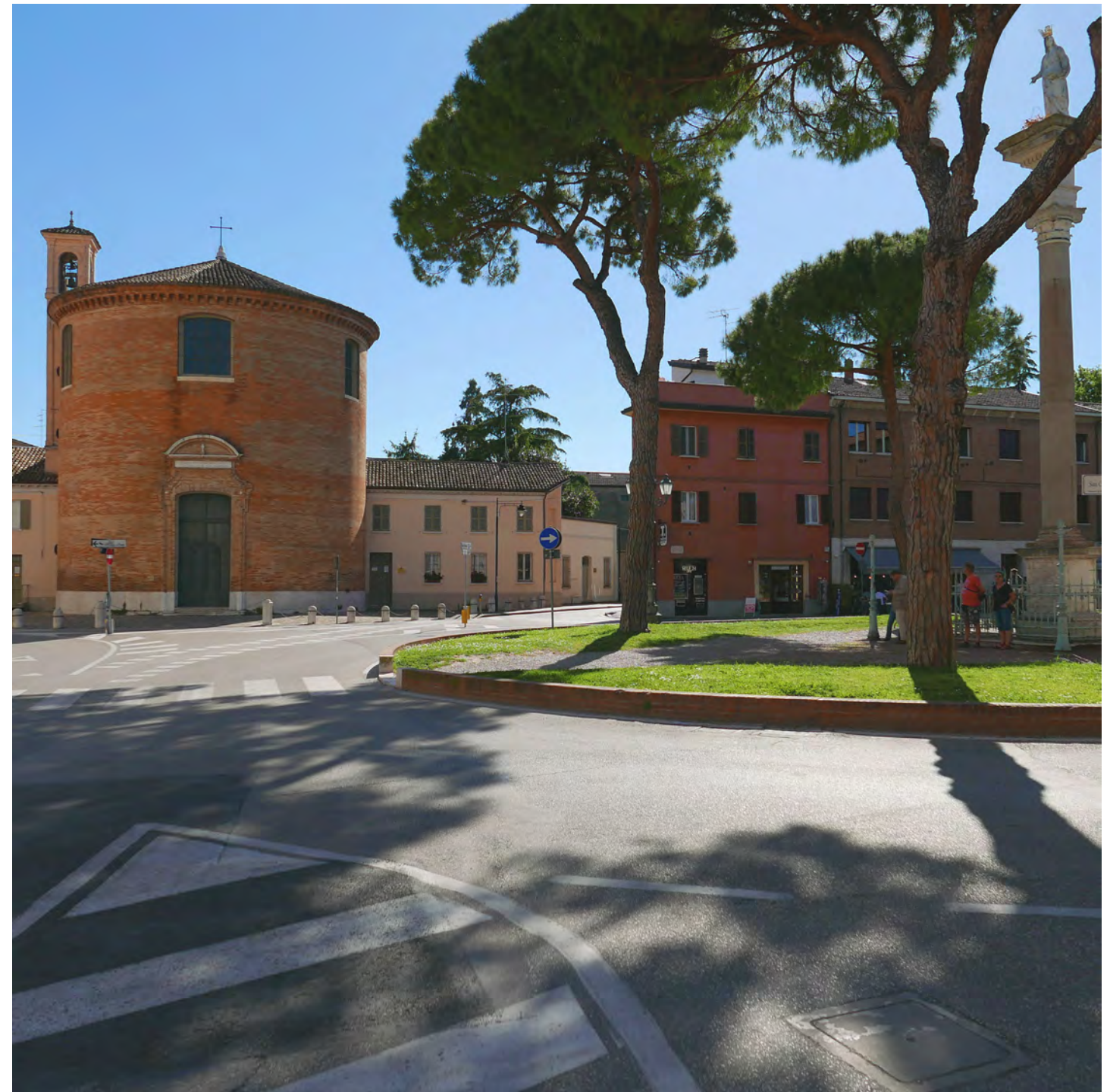
Piazza Duomo, Ravenna