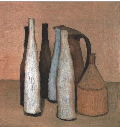
< Piazza Maggiore, Bologna